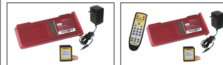
DCF-350T DCF-302T DCF-303T