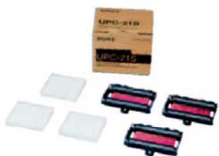
UPC-21S Colour Print Pack