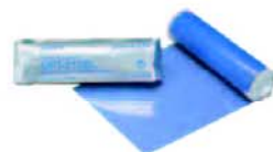
UPT-210BL Type III Blue Thermal Transparent Film