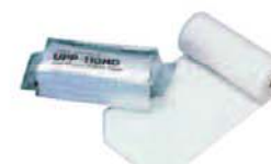
UPP-110HD Type II High Density Print Media