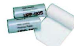
UPP-110S Type I High Quality Print Media