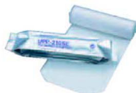
UPP-210SE Type II High Quality Print Media