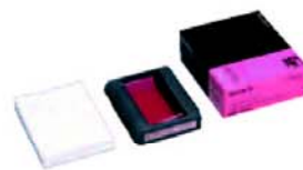
UPC-1010 Colour Print Pack