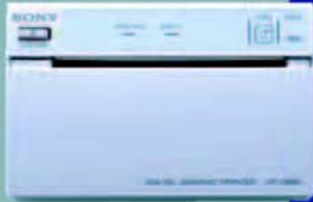
UP-D895 Digital Video Graphic Printer