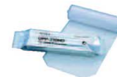
UPP-210HD Type II High Density Print Media