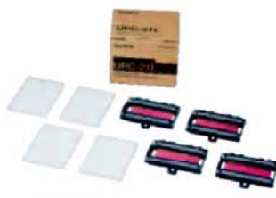
UPC-21L Colour Print Pack