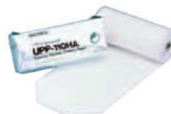
UPP-110HA Type IV Superior Density Print Media