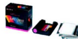
UPC-2010 Colour Print Pack