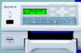
UP-21MD Colour Video Printer