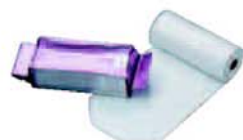
UPP-110HG Type V High Glossy Print Media