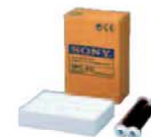
UPC-510 Colour Print Pack