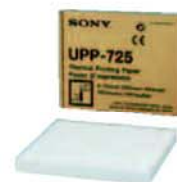
UPP-725 Thermal Print Media