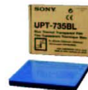
UPT-735BL Blue Thermal Transparent Film